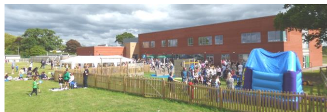
PTA Fun Day

I would like to thank you all for the support you have given the school this year, through attendance at school events (productions, concerts, PTA fun day), supporting your children's education at home, reinforcing the school's rules and generally being active members of our school community – it is much appreciated.