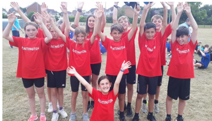
Year 6 athletes