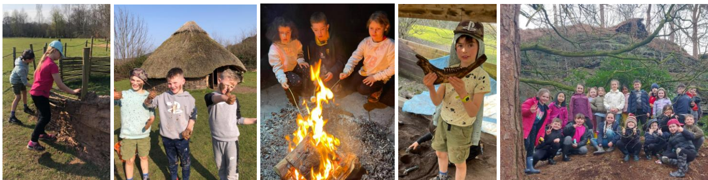
Outdoor adventures for Year 3 at the Burwardsley Centre

Despite the considerable Spring term disruption caused by Covid-19, affecting both pupil and staff attendance, planned events have been largely unaffected. Both Year 3 classes enjoyed residential visits to the Burwardsley Outdoor Education Centre at the end of March, experiencing fine weather and a range of activities based on their Stone Age to Iron Age history topic.