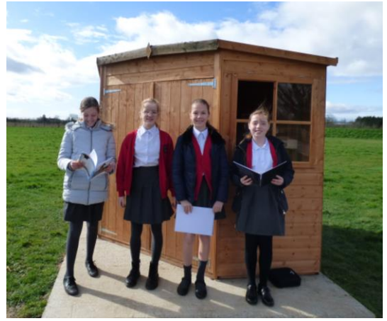
Y6 pupils outside the Reading Shed