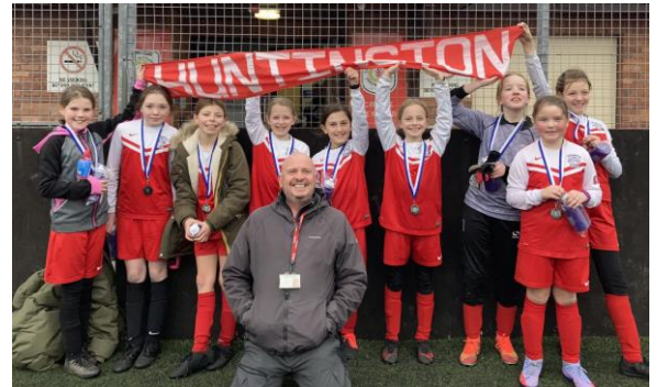
Girls' football team – county runners-up!

This term our pupils have taken part in a netball tournament and several football fixtures (league and cup, both boys and girls teams). While our girls team has won all their local league matches, the undoubted highlight was their participation in the county finals at Crewe Alexandra's training ground. A series of excellent performances culminated in a place in the final itself. Against a very strong opponent, tiredness eventually told, but a place as county runners-up is a tremendous achievement worthy of celebration.