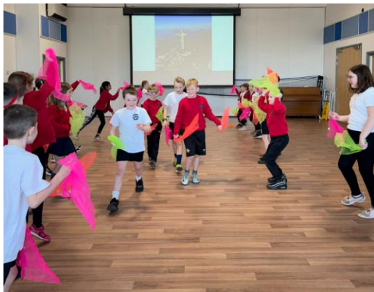
Carnival Dance (Y4 PE)