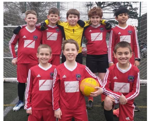
Y6 Footballers at Christleton High