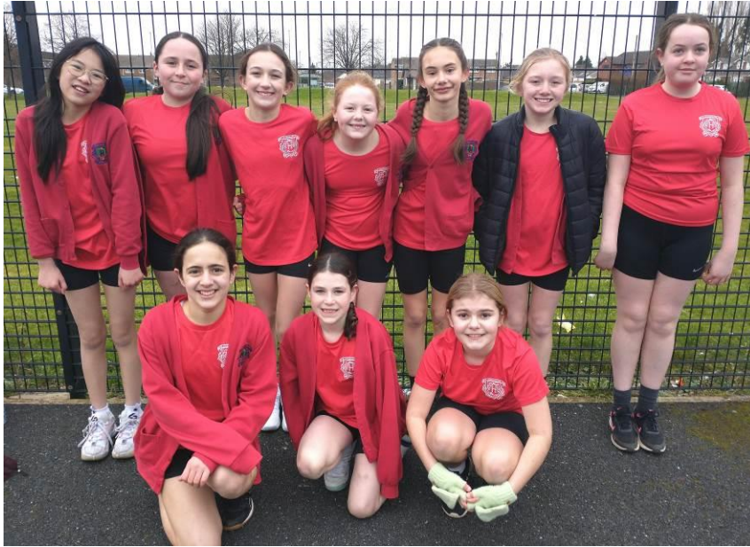
Y6 Netball Team