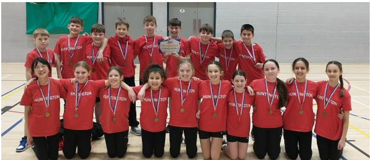
Y6 Sportshall Athletics team with their medals