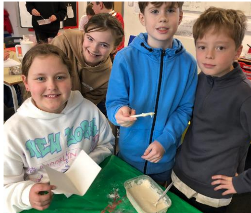
Making glue (Y5 Science)