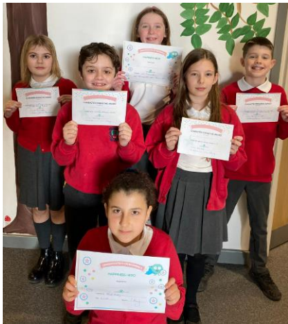
Identifying Character Strengths Y6