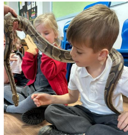
Animals Take Over (KS1)