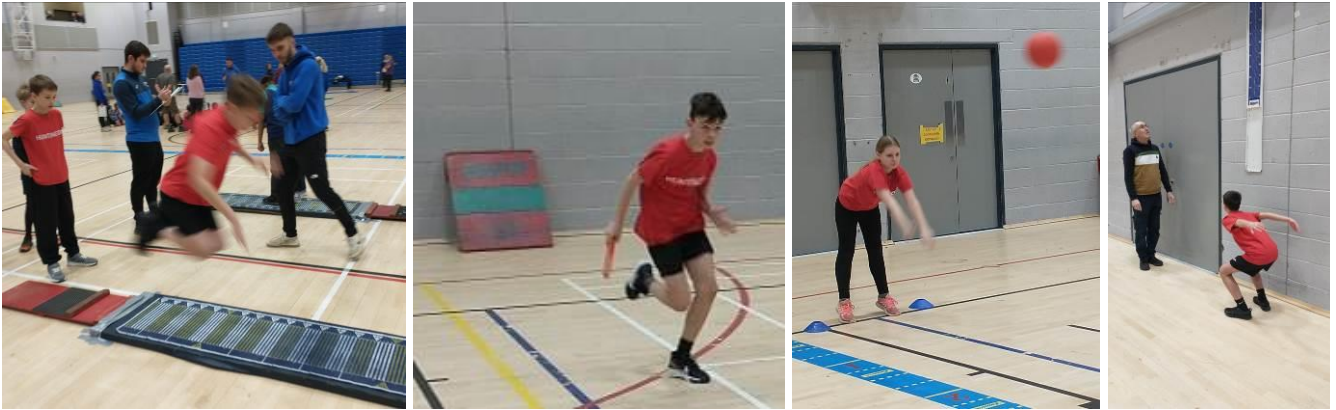
Sportshall Athletics events: standing long jump, relay, chest push throw, vertical jump

The Chester School Sport Partnership arranged a Sportshall Athletics event at Ellesmore Port Sports Village in January, and we were delighted to come first on the day (and fourth overall of the schools competing over the two days). Nineteen Y6 pupils took part in a range of activities, from javelin and standing long jump to relays and hurdles, and the team supported each other well throughout.