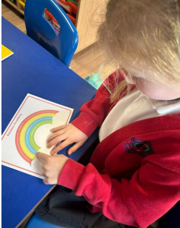
Breathing Techniques KS1

Lots of activities took place during Children's Mental Health Week (Feb 3-7), including the Dress to Express fundraiser as well as classroom sessions to support this year's theme of Know Yourself, Grow Yourself . Happiness Heroes and Zones Ambassadors were also appointed, to help fellow pupils develop their skills.