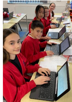
Spreadsheets (Y6 IT)