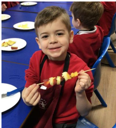
Making fruit kebabs in KS1