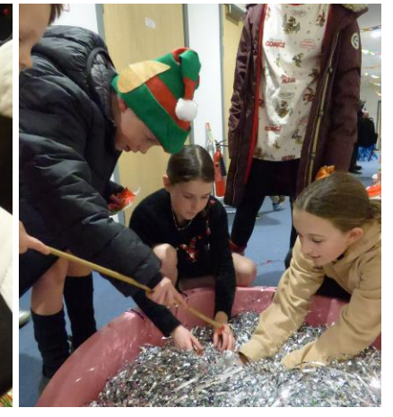
Scenes from the PTA Christmas Fayre

The PTA have committed to fund a range of school projects over the coming year, including: