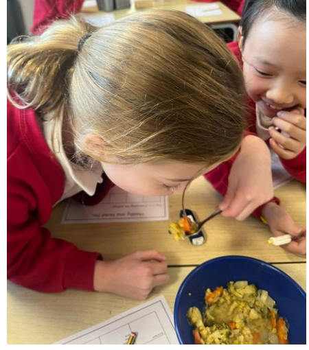
Y4 tasting their Roman pottage