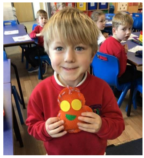
KS1 sewing – a friend for Nibbles Y5 Science: separating materials