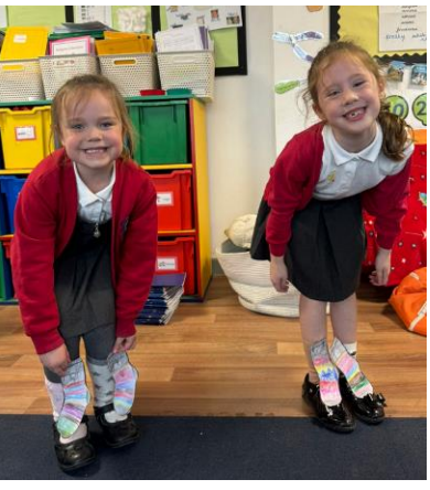
Odd Socks Day