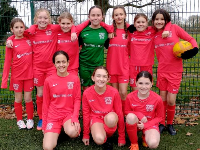
Y6 Footballers at Liverpool FC Academy