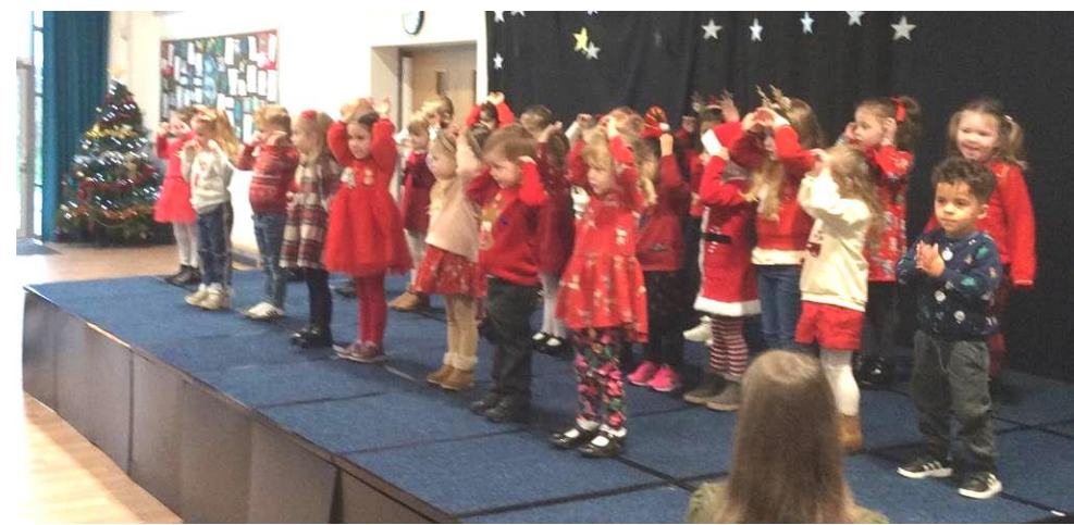
Nursery children on stage for their show

With a very late finish to the autumn term this year, Christmas is almost upon us, and everyone is very much in the festive mood. Our ninth Christmas performance yesterday morning, by the Nursery children, capped a wonderful series of shows, with Reception, KS1. Y3/5 and Y4/6 also entertaining family audiences as well as the children in school during dress rehearsals. It has been wonderful to see the confidence with which our pupils took to the stage.