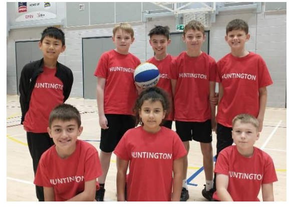
Y6 Basketball Squad

Year 6 pupils also took part in a basketball competition at Ellesmere Port Sports Village, showing considerable ability and team spirit, and achieving a draw against the ultimate tournament winners in the group stage. Well done on some great performances!