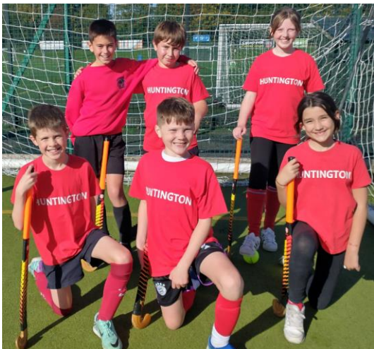
Y6 Hockey Squad

Finally, the first of several ESFA football tournaments took place yesterday at Christleton High, with our Y4 girls' squad performing with great enthusiasm and teamwork against other Chester schools. They enjoyed excellent, good-spirited support from family members (commented on favourably by the organiser) and were in contention for a place in the final until the last group game – an excellent effort on a very enjoyable afternoon.