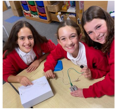
Y6 making a Steady Hand game