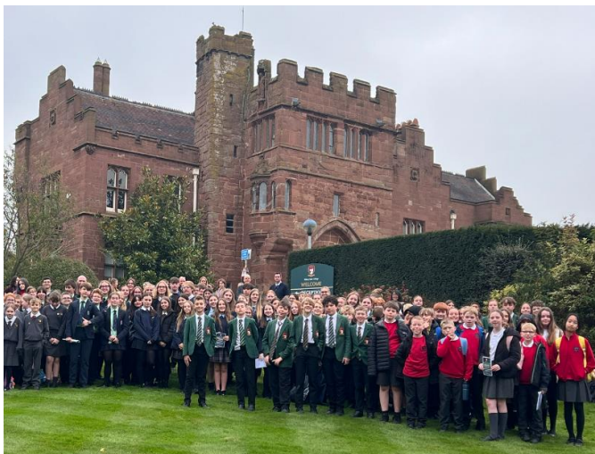
Attendees at the conference – our pupils at right

Ten of our Year 6 children attended the Cheshire Schools' Sustainability Conference at Abbey Gate College on Friday 8th November. There were informative talks on sustainable planting, biodiversity and sustainable food choices, and they heard how other local schools are undertaking exciting projects to support and improve sustainability. Our pupils left the event feeling more inspired than ever to take action in helping our school and the wider community live more sustainably, and will be working with our Eco Council to implement change throughout the academic year.