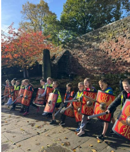
Y4 Romans at the amphitheatre