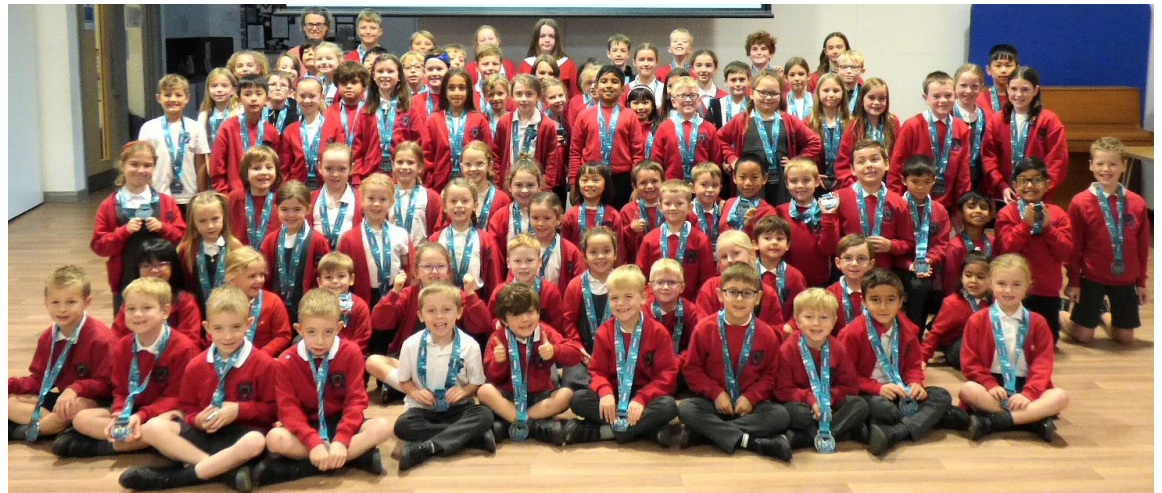
MBNA Mini Marathon participants

For the third year running, we had the most competitors taking part in MBNA's Mini Marathon from a single school - and therefore retained the beautiful trophy. Well done to all our runners - staying healthy, and raising funds for Claire House by taking part.