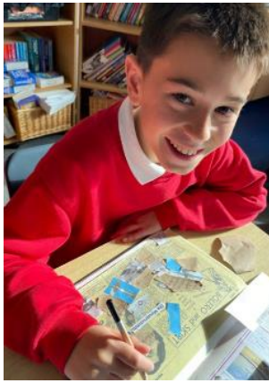
WW2 Mood Board