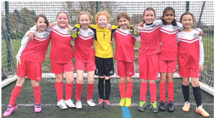
Y4 Girls' Football Squad