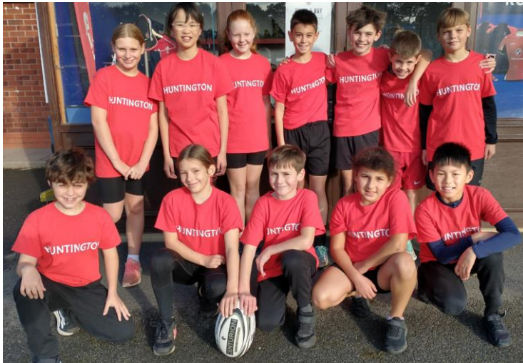
Y6 Rugby Squad

The sporting calendar began with touch rugby festivals for Y4 and Y6 pupils, hosted at Chester Rugby Club and organised by the Chester School Sport Partnership (CSSP). Our pupils really enjoyed themselves, winning the majority of their games and further developing the skills they have been practising in PE lessons.