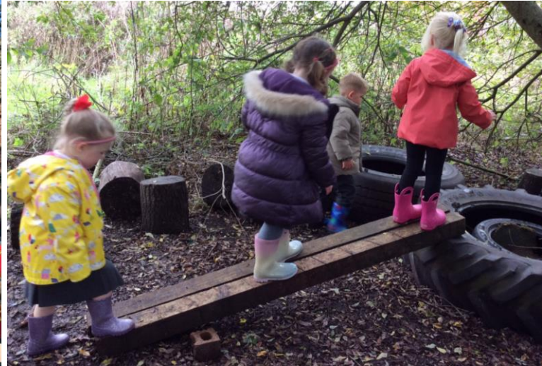
Nursery in Forest School