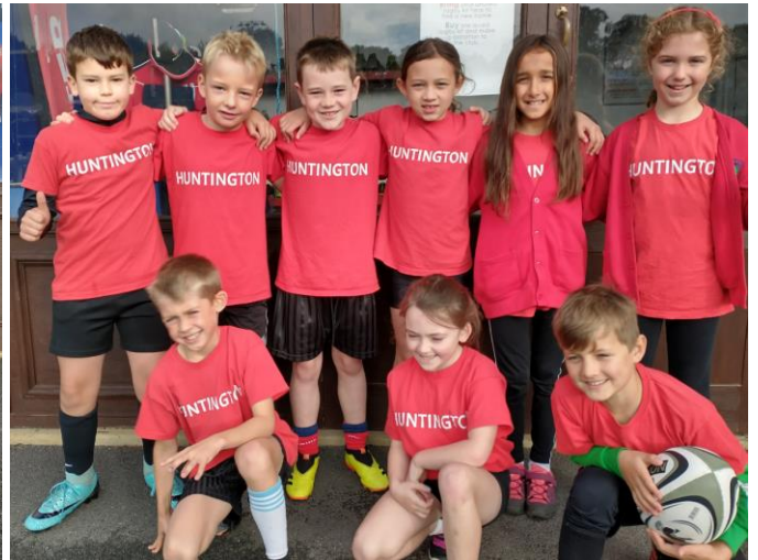
Y4 Rugby Squad