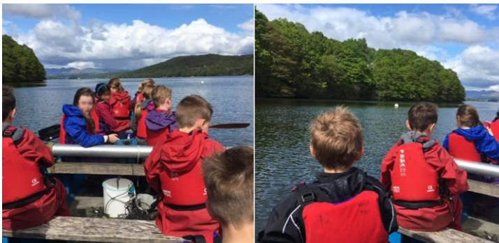
Y4 residential visit to The Lake District