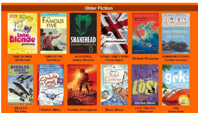
Our online library: inspiring reading