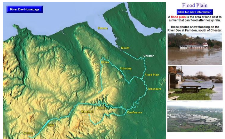
GEOGRAPHY: Our own River Dee website, used in high schools to support GCSE work