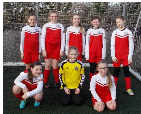
SPORT: Girls' Football, Cheshire Finalists