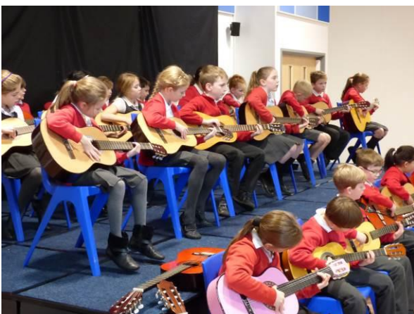
MUSIC: Guitar concert in the hall