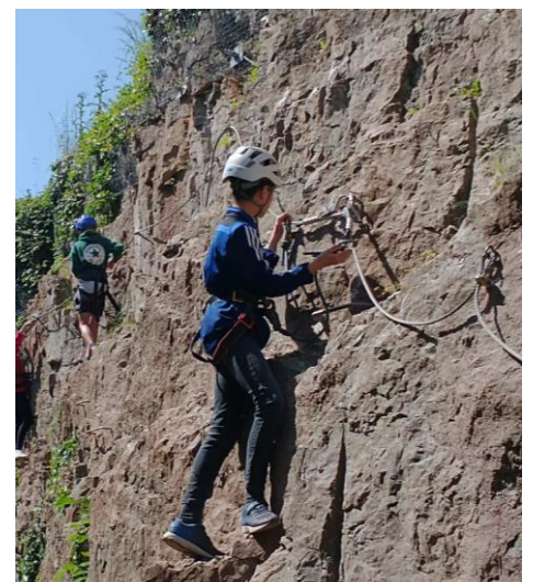
Year 6 residential visit to the Conway Centre