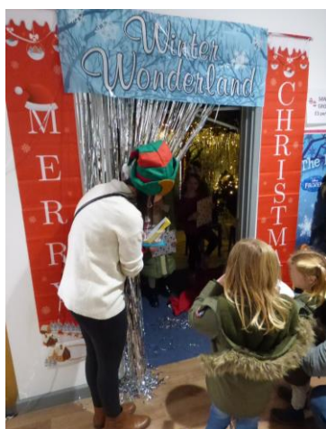
Santa's grotto at the PTA Christmas Fair

We aim to make our school as friendly and familiar for parents as it is for the children. Parents are welcome to help in school in many ways, including working with reading groups, helping with cookery and artwork, and giving specialist talks. Every parent/carer is automatically a member of our Parent Teacher Association (PTA), which plays a vital role in raising funds for additional school resources and also provides a range of entertaining events for both children and parents (e.g. Christmas Fair, below left). The PTA have a lively Facebook page where you can keep up to date with all that's going on.