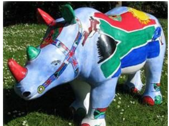
ART: A rhino sculpture, decorated by our pupils with designs from our partner school in Cape Town