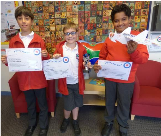
DESIGN & TECHNOLOGY: National finalists in the Bloodhound 'Fly to the Line' competition