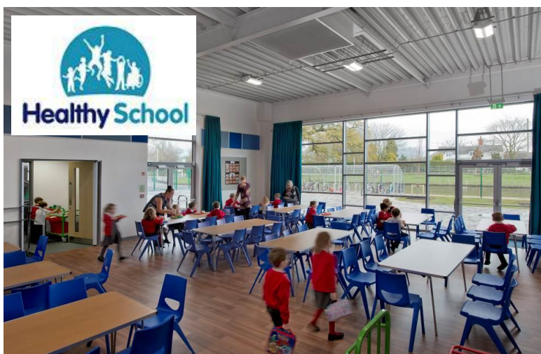
Lunchtime in our light and bright hall

All children should bring a water bottle (labelled with name) to school, which can be refilled during the day from the water cooler. Bottles are kept in the classrooms for ready access during lessons. The school has adopted a Milk or Water Only policy across the site, and milk is provided free of charge to Reception children.