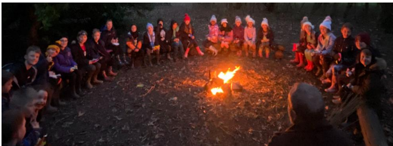
Y3 residential visit to Burwardsley

All classes benefit from opportunities to learn outside the classroom, either within the school grounds, during educational day visits planned to enhance the study of the current theme, or in the junior years through residential visits to Outdoor Education Centres. The most powerful, memorable learning is often acquired through such first-hand experiences, and the school is committed to maximising these opportunities.