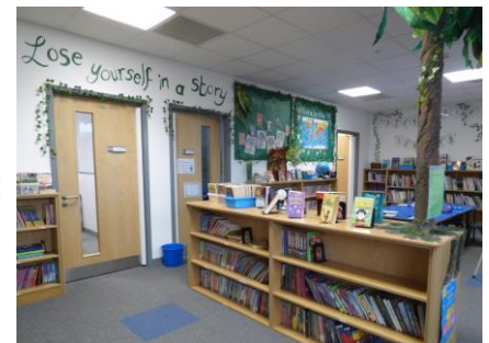
Our junior library

Writing: We follow a mastery approach to writing using the award-winning programme Pathways to Write from The Literacy Company . Units of work are delivered using high quality texts and children in all year groups are given varied opportunities for writing. Skills are built up through repetition within the units, and children apply these skills in the writing activities provided. Many opportunities for widening children's vocabulary are given through the Pathways to Write approach and this builds on the extensive work we do in school to provide our children with a rich and varied vocabulary.