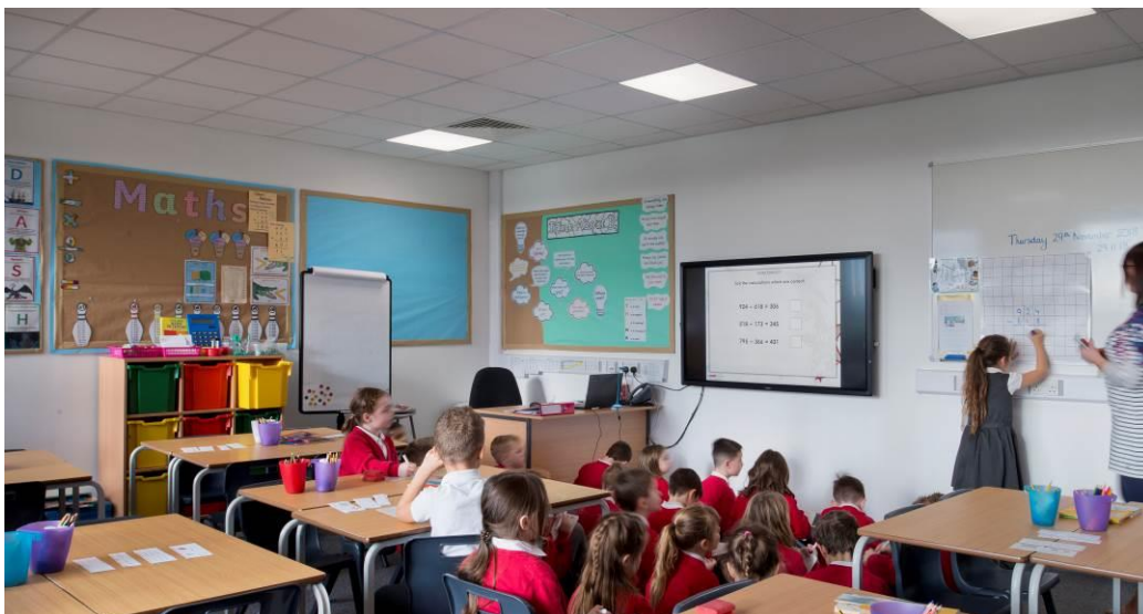
Junior children sharing their learning