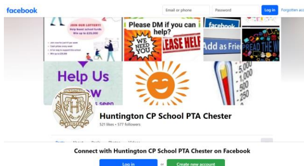
The PTA Facebook page