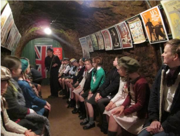
HISTORY: WW2 brought to life for Year 6 at Stockport Air Raid Shelters