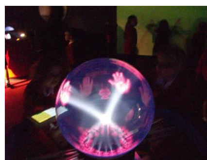
A Science day visit