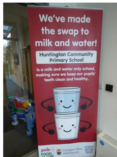
We are a Milk or Water Only school