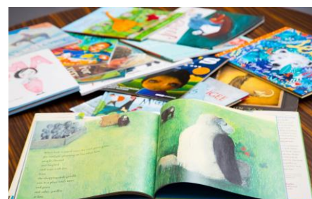
Quality texts to support writing