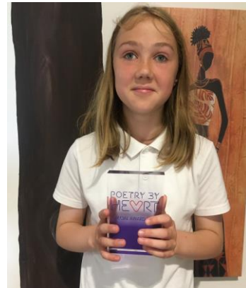
National poetry recitation winner

Speaking and Listening: Effective communication skills are developed during a wide range of activities, from structured role play and class discussions to more formal presentations in assemblies, prepared talks and participation in special events (e.g. No Pens Day , Poetry by Heart (a national competition won in 2021 by our Y6 pupil pictured at right)).