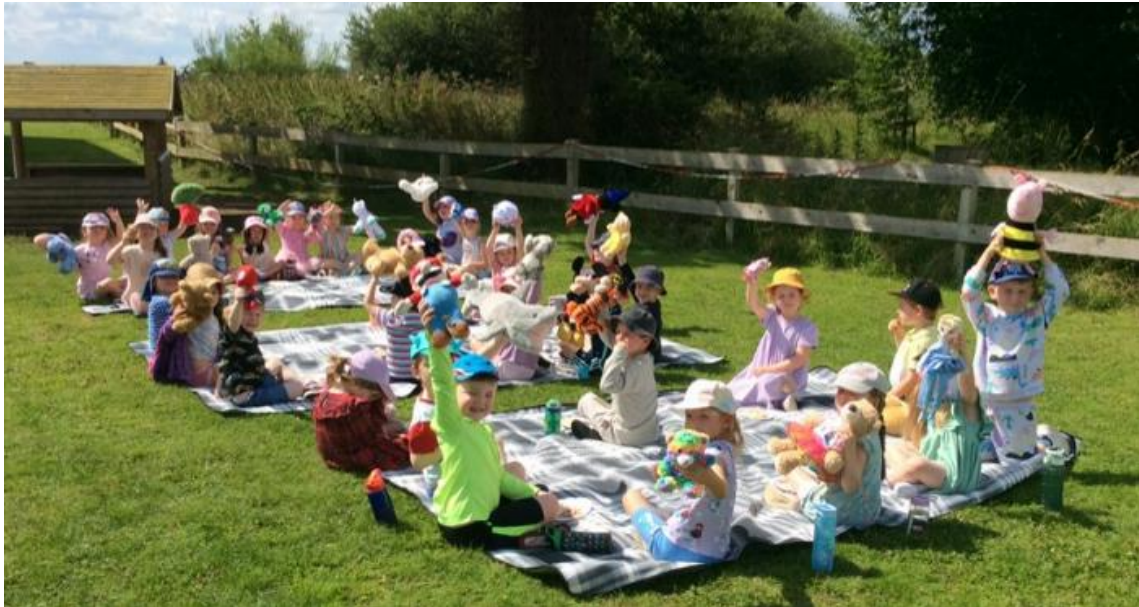
Nursery Teddy Bear's Picnic