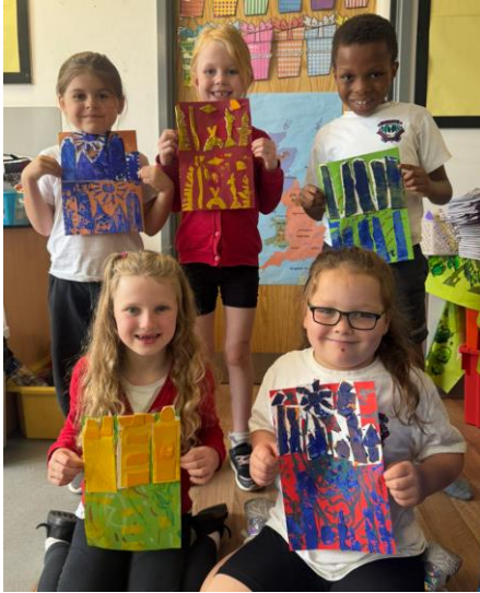
Printing in KS1 Beech