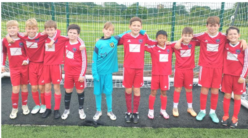
Y6 boys' Chester Finals squad