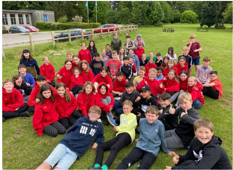
Y6 Conway Centre residential