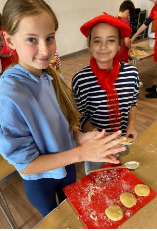
Year 6 baking on French Day