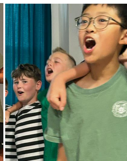
Leavers' Show: Robin and the Sherwood Hoodies