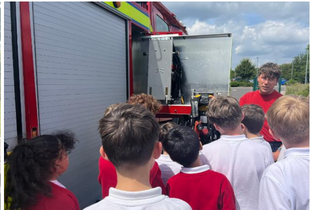
Examining fire engine equipment