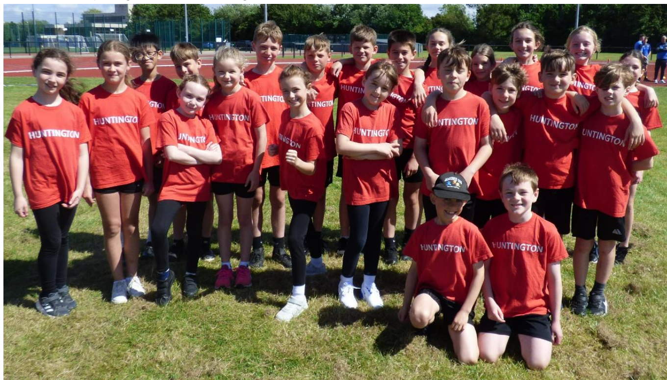
District Athletics Squad

Our membership of both Chester school sports organisations (CSSP and CSSA) gives our pupils access to a range of events throughout the year, and in the summer term these included Rounders and Tri-Golf for Year 6, and the District Athletics. While we could not realistically hope to feature on the podium at the Athletics, since the vast majority of Year 6 were away at the Conway Centre, pupils from Year 3-5 were still able to enjoy the experience of competing in track events against other schools in Chester.