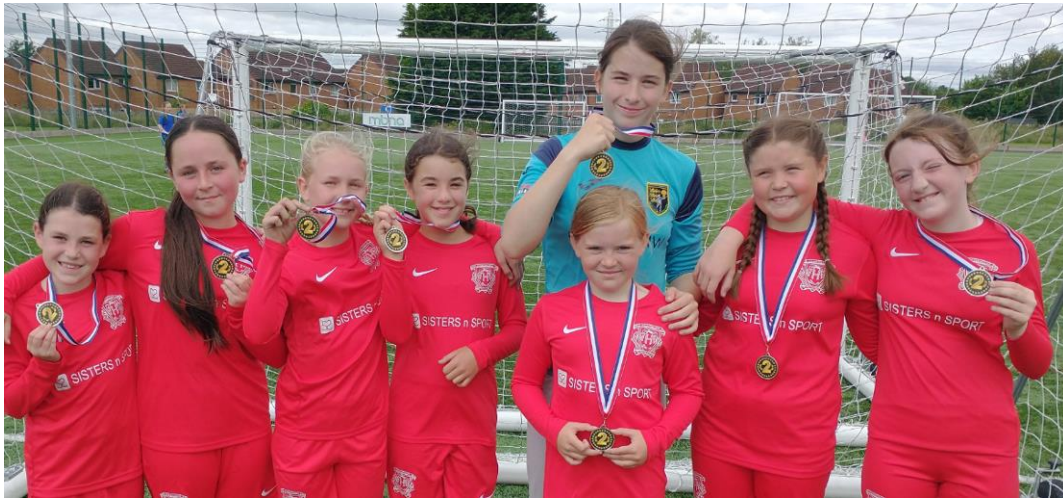
Y5/6 girls' team with their Chester Finals runners-up medals

All three of our teams with league programmes reached the Chester Finals Days, for the second year running – a brilliant effort, leading to multiple visits to the King George V facility in Blacon over the last fortnight. Our Y5/6 girls' team performed extremely well and were runners-up on the day, in a closely fought final against Boughton Heath.