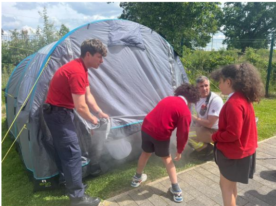
Cheshire Fire Service smoke tent