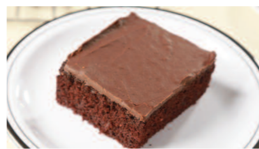
Iced Wacky Chocolate Cake