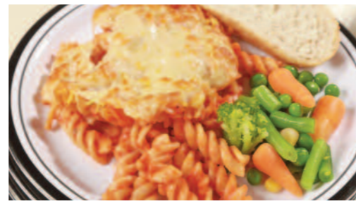
3 Cheese & Tomato Pasta served with Garlic & Herb Bread and Seasonal Vegetables