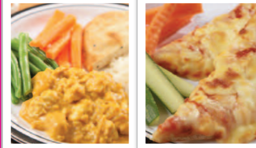
Chicken Korma served with Rice, Naan Bread & Seasonal Vegetables or Deep Pan Cheese & Tomato Pizza Slices served with Carrot & Cucumber Sticks