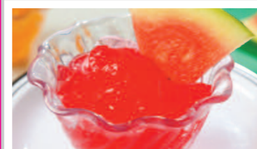
Jelly & Fruit