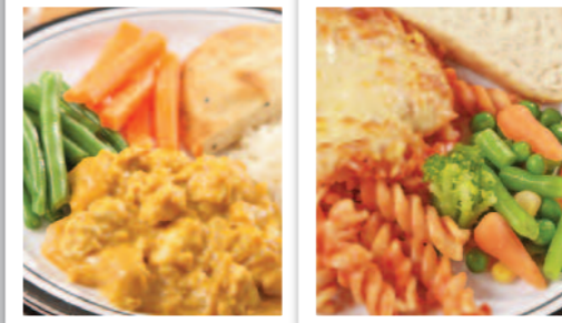
Chicken Korma served with Rice, Naan Bread & Seasonal Vegetables or 3 Cheese & Tomato Pasta served with Garlic & Herb Bread and Seasonal Vegetables