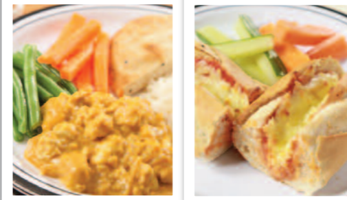
Chicken Korma served with Rice, Naan Bread & Seasonal Vegetables or Hot Pizza Baguette served with Carrot & Cucumber Sticks