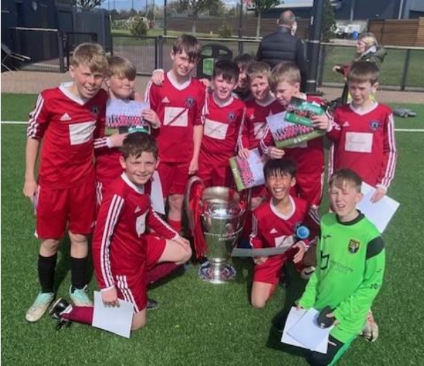
Y6 team with the European Cup!