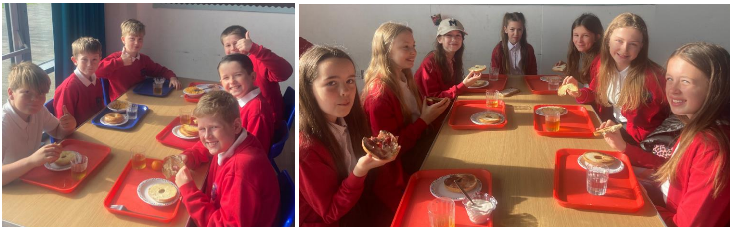
SATs breakfasts in the hall...