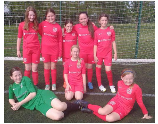
Y6/5 Girls' team at Christleton High