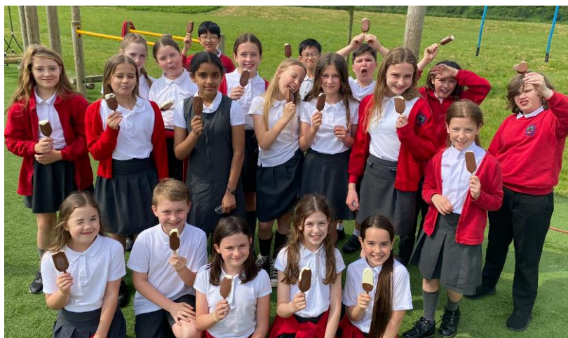
...and ice cream at the end of the week