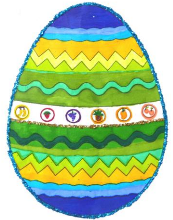
KS1: Savir B