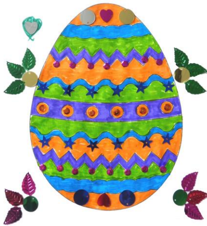
KS1: Emmy C