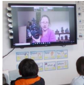
Y5 Maya artefact Q&A