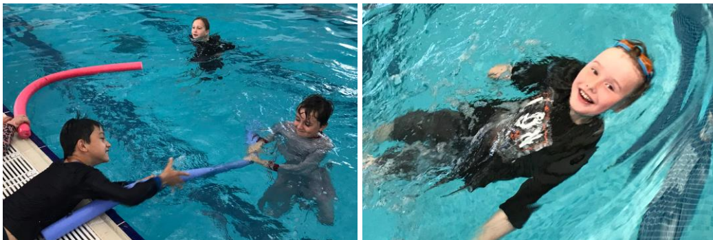
Year 4 pupils enjoying survival skills tuition at Christleton pool

Year 4 rounded off their swimming programme with survival skills in the pool, fully clothed (in pyjamas!). They had a lot of fun learning an essential life skill, working co-operatively to develop the ability to keep themselves and others safe. Some Y6 pupils also benefited from additional lessons at the Northgate Arena to boost their technique, in a programme facilitated by the Chester School Sports Partnership, our membership of which is funded by the government's PE and Sports Premium.