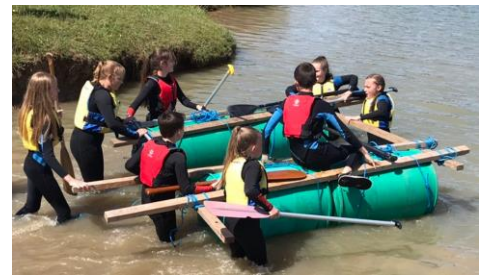
Y6 building rafts at Manley Mere

Sports Day was replaced by Sports Week, during which the various year groups participated in all the usual events, with photos and videos made available online so that parents/carers could feel as involved as possible. Newgate were the winning house for the junior events.