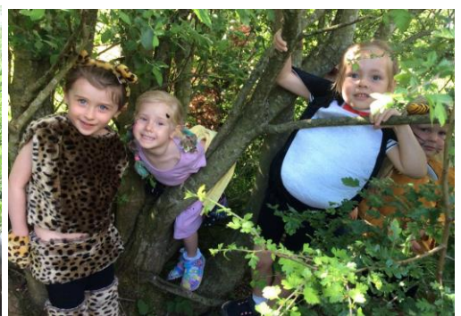
Spotted in the Forest School area on Wear it Wild day!