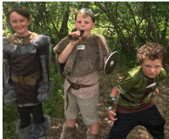
Y4 Vikings ready for action