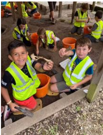
Y3 at Burwardsley

It was third time lucky for Year 6 as far as an adventurous activities trip went, with a great day enjoyed at Manley Mere following the cancellation of both the usual Conway Centre visit and then the alternative day visit to Colomendy, as a result of national and local guidance respectively. Year 3 were also lucky enough to enjoy a good sample of the activities usually experienced during the Burwardsley residential, on a day visit there (possible since the centre is within the CWAC council area). Year 4 enjoyed a Viking day within the school grounds, and Year 5 a Maya day, in addition to a live video Q&A with a Maya archaeologist.