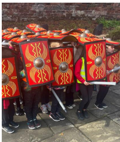
Y4 as Roman soldiers