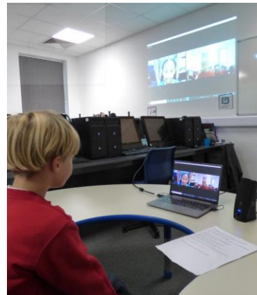
Video link to South Africa