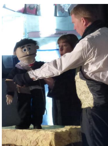
A Christmas Carol