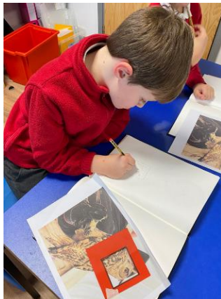
Using a viewfinder in art