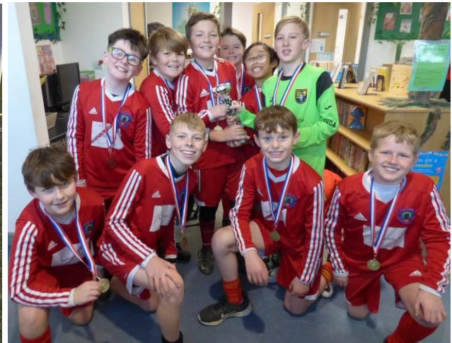
Y6 Boys football team – Chester area winners