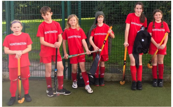
Y6 Hockey squad