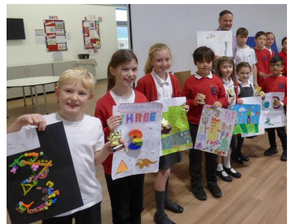
Maths Week Competition Winners