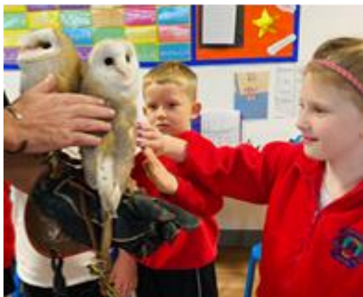
KS1 visit from The Owl Man