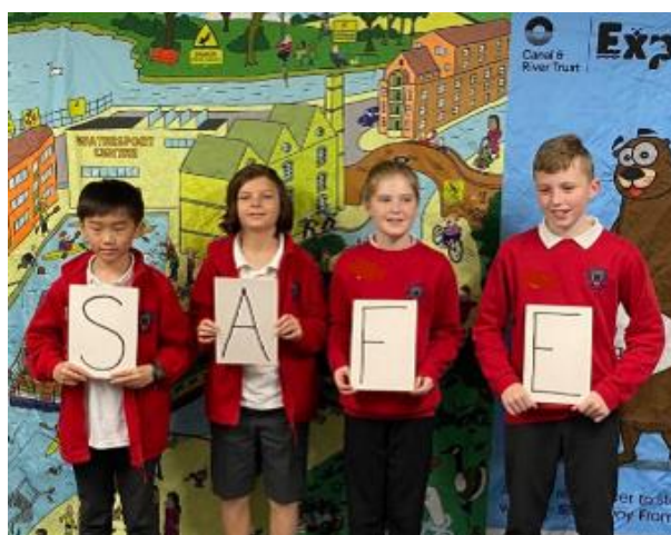
Y6 safety training ( Crucial Crew )