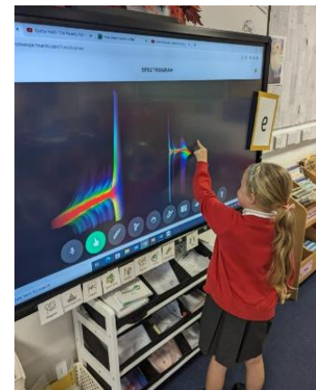
Making music online: KS1