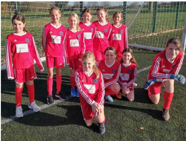
Y5/6 Girls football team – Chester area finalists