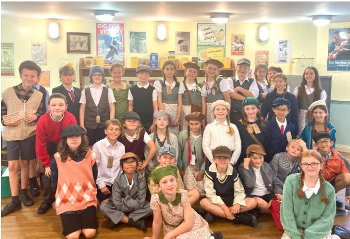
Y6 evacuated to Stockport in the most stylish of 1940s' fashion