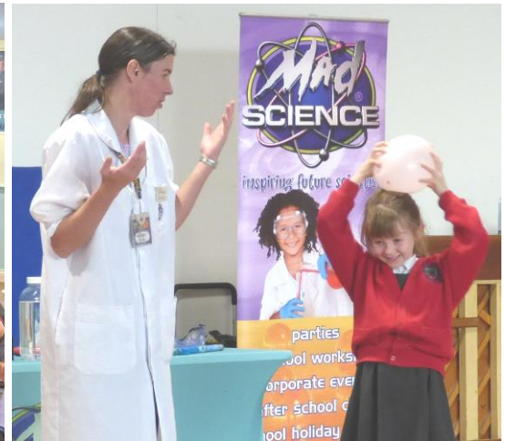
A hair-raising Mad Science assembly