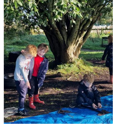
Forest School fun