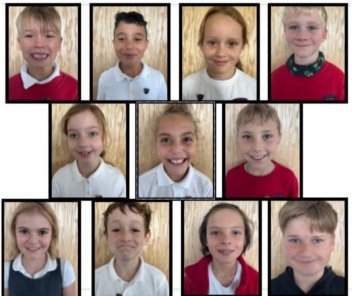
School Council 2023-24

See our Children's Councils page on the website for more details.