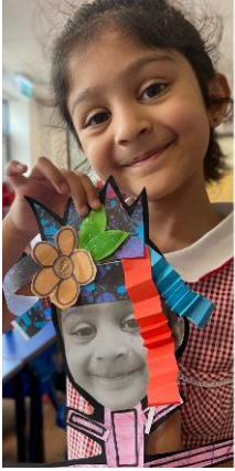
KS1 troll art (collage)