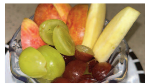
Apple & Grape Pot