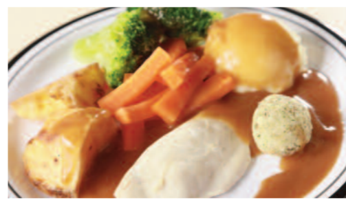
Roast Chicken served with Roast/Mashed Potatoes, Seasonal Vegetables & Gravy