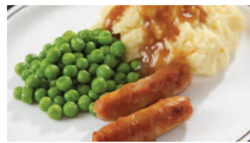
Sausages served with Mashed Potato, Seasonal Vegetables & Gravy