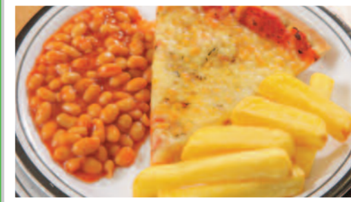
Cheese & Tomato Pizza served with Chips & Peas or Baked Beans