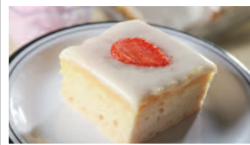
Strawberry Ice Cream Cake