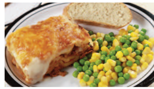
Beef Lasagne served with Garlic & Herb Bread and Seasonal Vegetables