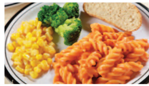
Tomato & Mascarpone Cheese Pasta served with Garlic & Herb Bread and Seasonal Vegetables