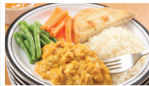
Chicken Korma served with Rice, Naan Bread & Seasonal Vegetables