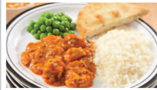
Chicken Tikka Masala served with Rice, Naan Bread & Seasonal Vegetables