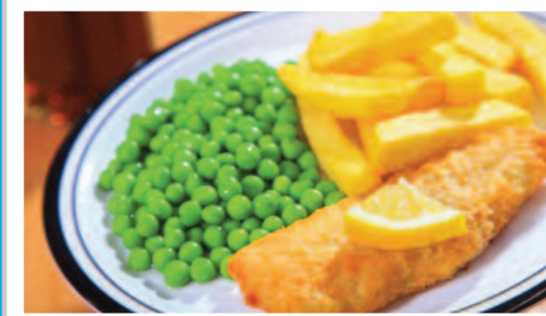
Battered Fish (MSC) served with Chips & Peas or Baked Beans

VEGETARIAN VERSIONS OF THE ABOVE MEAL AVAILABLE DAILY