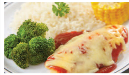
BBQ Chicken served with Savoury Rice and Seasonal Vegetables