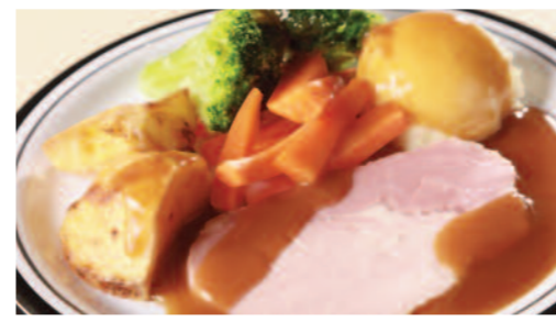
Honey Roast Gammon served with Roast/Mashed Potatoes, Seasonal Vegetables & Gravy