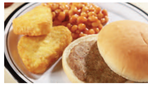
Sausage Pattie in a Bun, Hash Browns and Baked Beans