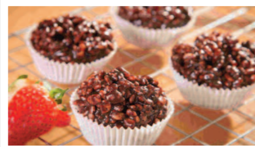
Chocolate Crispy Cake