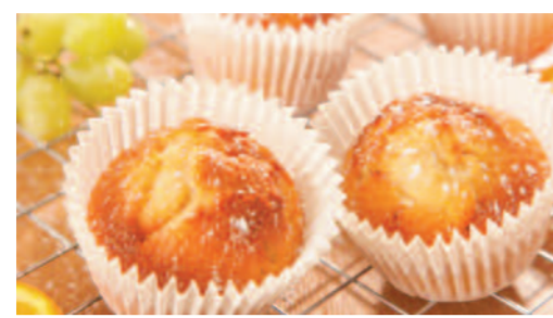
Apple & Cinnamon Muffin