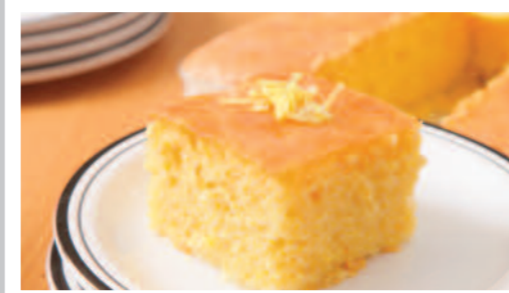
Lemon Drizzle Cake