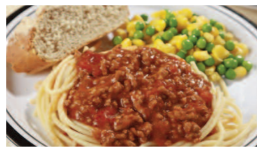
Spaghetti Bolognese served with Garlic & Herb Bread and Seasonal Vegetables