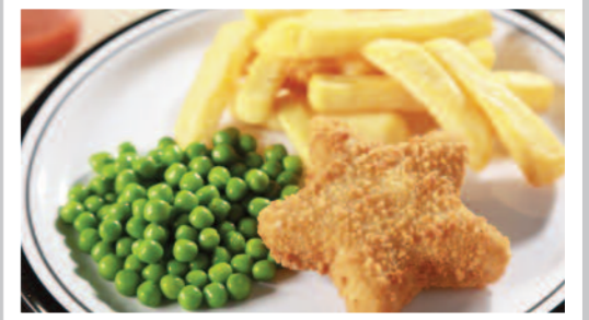
Fish Star (MSC) served with Chips & Peas or Baked Beans

VEGETARIAN VERSIONS OF THE ABOVE MEAL AVAILABLE DAILY