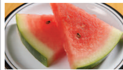
Fresh Water Melon Wedge