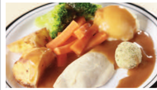
Roast Chicken served with Roast/Mashed Potatoes, Seasonal Vegetables & Gravy