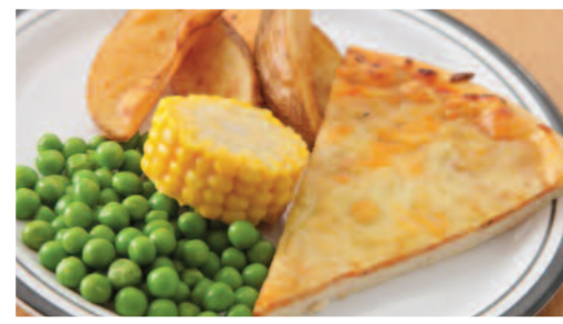
Cheese & Tomato Pizza, served with Potato Wedges & Seasonal Vegetables